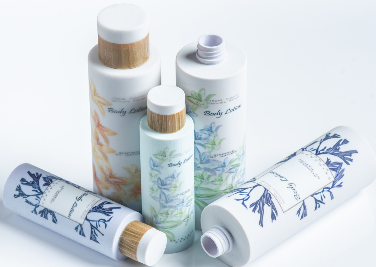
3D Printed in full-color on the J850.